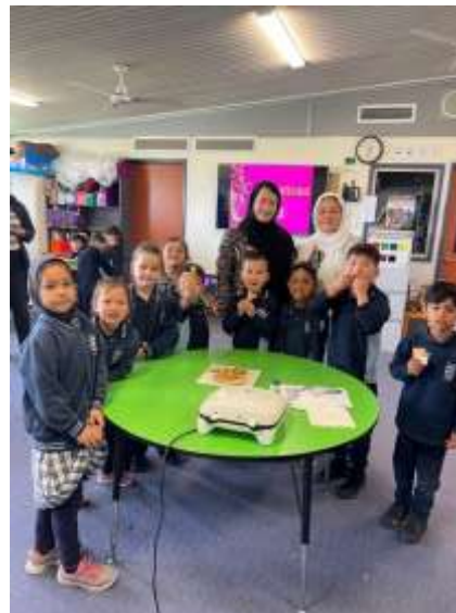
Step 5: Eat and enjoy!