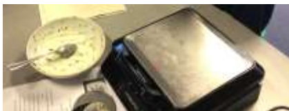
Step 4: Cook