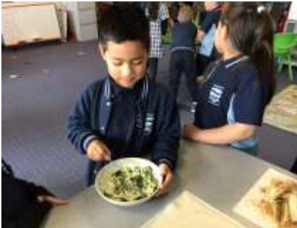
Step 1: Mix