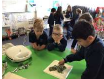
Step 2: Spread