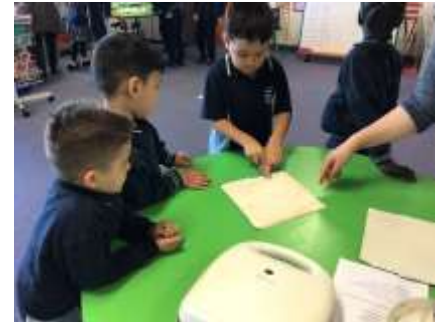
Step 3: Seal