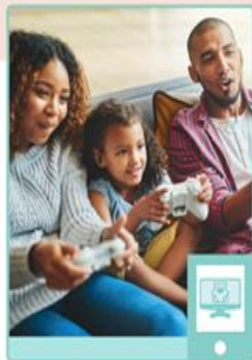
Why do you like it?