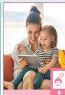
Only talk with people you know