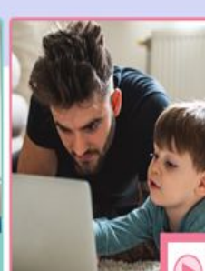
Check before you tap