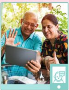
Say kind things