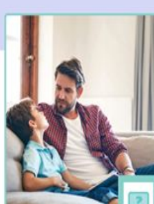
Tell a grown-up