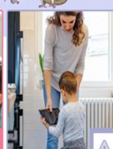
You won't get in trouble