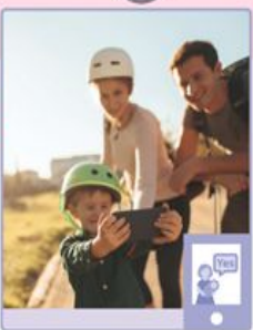
Ask before you take a photo