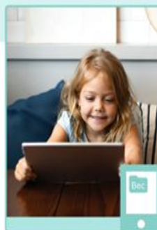
Play with the games and apps that are yours