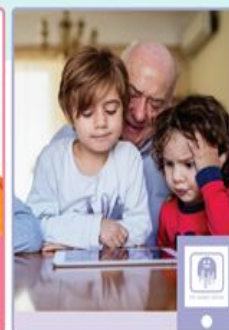
Some things should be kept private