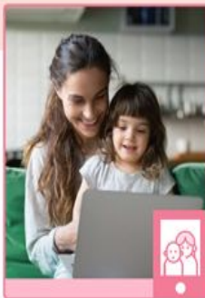
Use devices near a grown-up