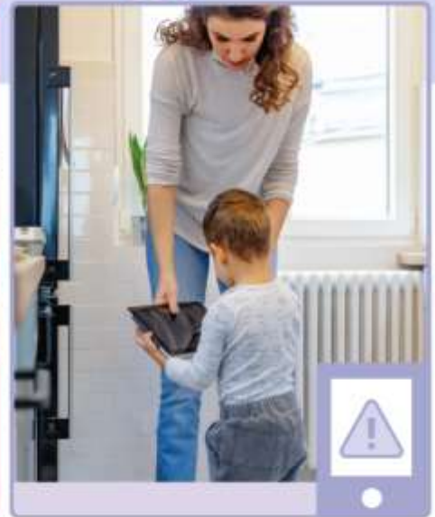
You won't get in trouble