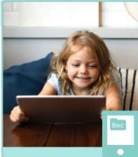
Play with the games and apps that are yours