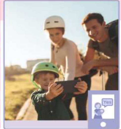
Ask before you take a photo