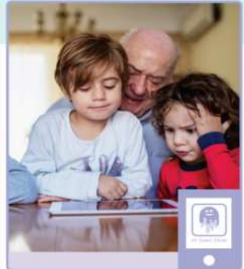
Some things should be kept private