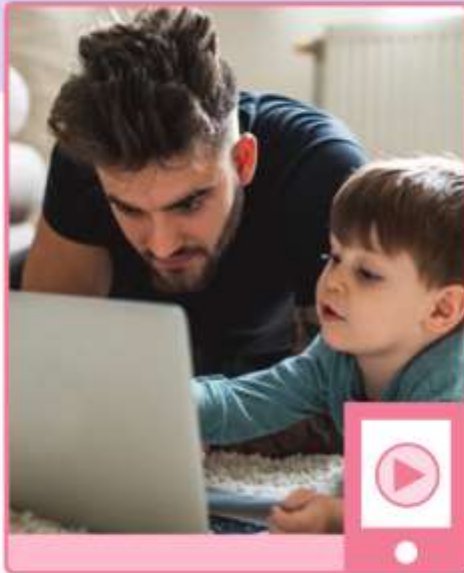
Check before you tap