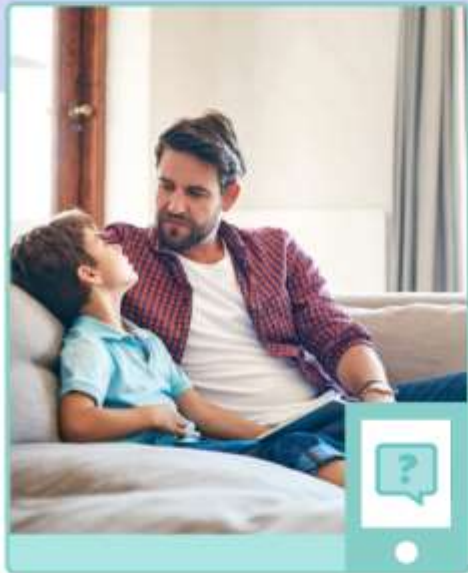
Tell a grown-up

We are Swoosh and Glide. Here are some tips to keep you safe online.