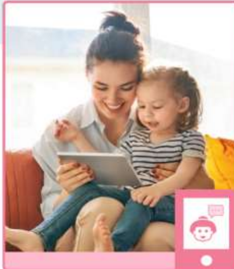
Only talk with people you know