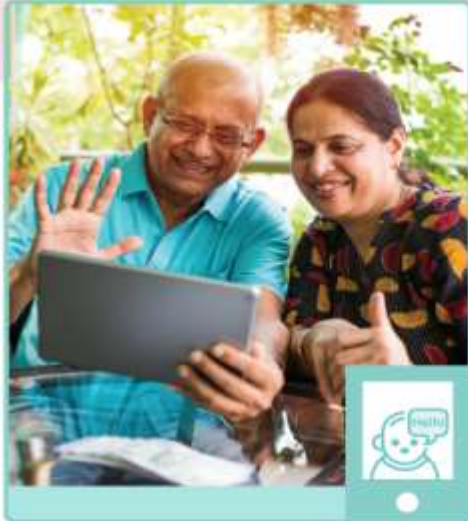
Say kind things