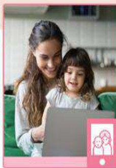
Use devices near a grown-up