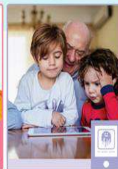
Some things should be kept private