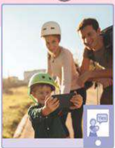
Ask before you take a photo