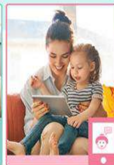
Only talk with people you know