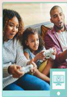
Why do you like it?