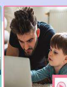
Check before you tap