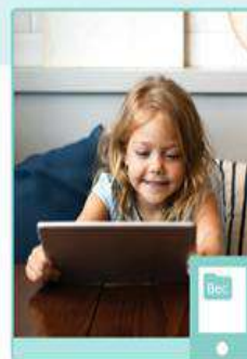
Play with the games and apps that are yours