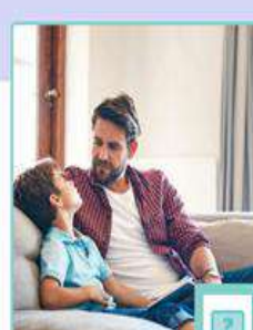
Tell a grown-up