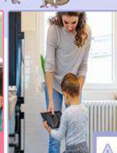
You won't get in trouble