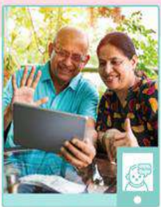
Say kind things